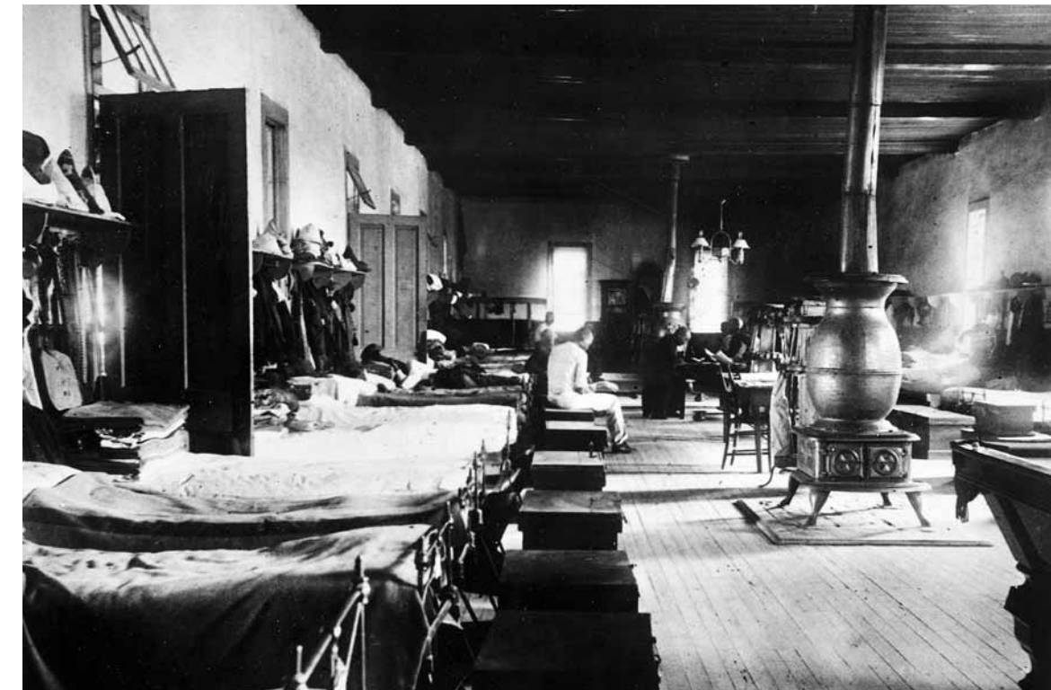
Interior of an 1887 adobe barracks at Fort Robinson. The all-black Ninth Cavalry lived in buildings that were identical to those of their counterparts in the all-white Eighth Infantry.