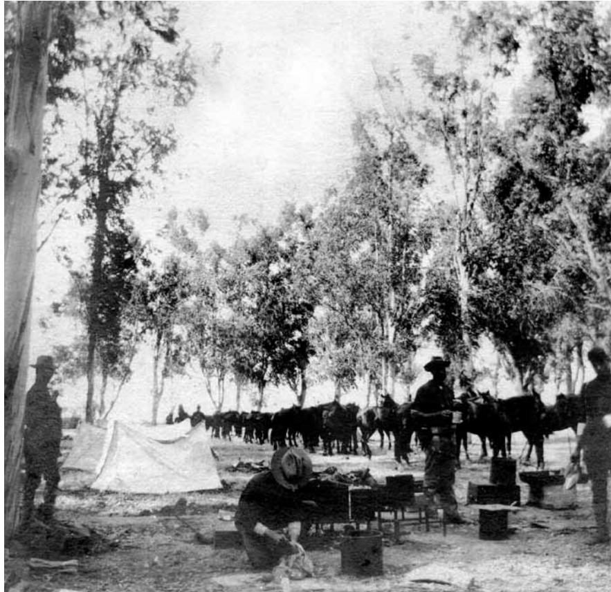
A photograph belonging to Charles Young showing a cavalry encampment, likely en route to Sequoia National Park in 1903.