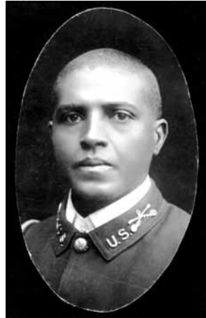
Lt. Charles Young graduated from West Point in 1889 and joined his Ninth Cavalry unit at Fort Robinson. Young went on to a long and distinguished career, eventually attaining the rank of colonel.

By 1890 the serious troubles with the Plains Indians were over, so the soldiers of the black regular